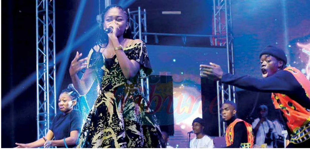
Figure 1 Popular Gospel Artiste Indira Baboke in One of Her Giant Concert in Cameroon